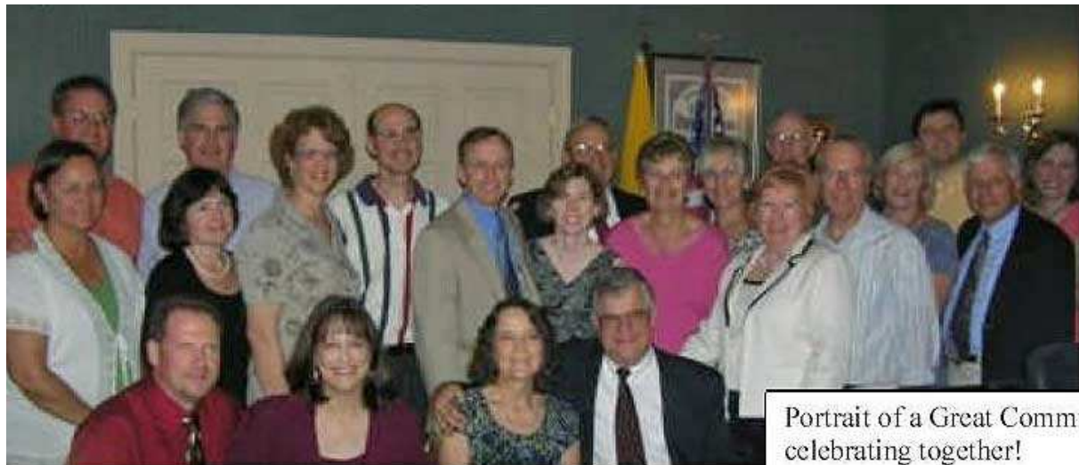
Portrait of a Great Community celebrating together!